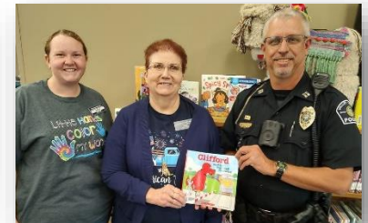
KS OL handed out hundreds of copies of Clifford's rail safety book to schools and libraries across Kansas.