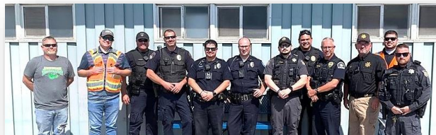
Emporia PD, Lyon County Sheriff's Office, BNSF railway, and KS OL partnered in an officer on the train event.