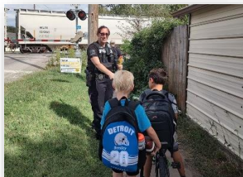
Vally Center PD handed out STTT pencils to kids at local crossings