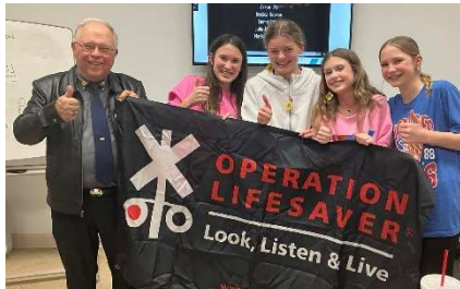
Midwest Driving School, Lawrence