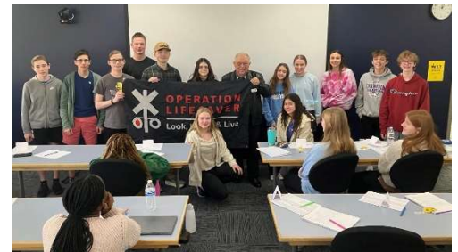
Behind the Wheel Driving School,