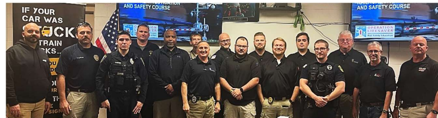
Valley Center Police Department, RISC Class