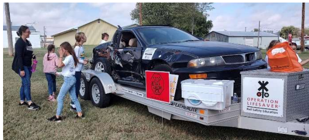
Progressive Agriculture Safety Day, Caldwell