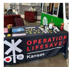
Easter Fest, Topeka

Check out OLI's newest What Should I Do? lesson plan only available to SCs and OLAVs in the OLAV Resources areas of the OL Community. The lesson plan highlights the Emergency Notification System sign. Learning objectives include: