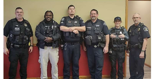
RISC Course, Osage County Sheriff's Office